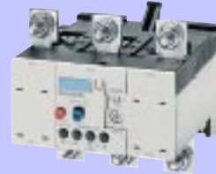
3UA overload relays up to 205/820 A Class 10