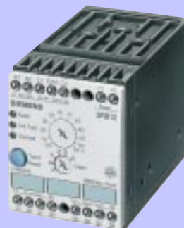
3RB12 overload relays up to 800 A Class 5 to Class 30