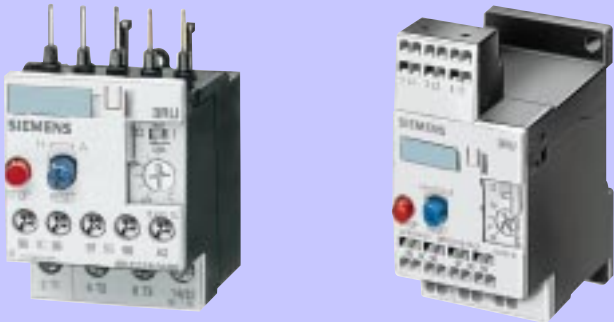
3RU11 overload relays up to 100 A Class 10