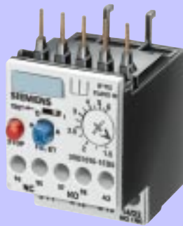
3RB10 overload relays up to 100 A Class 10 and Class 20